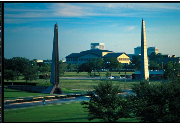
OPPORTUNITY 2 Create a sculptural looking vertical element as a gateway feature