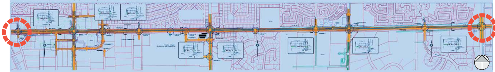
Context map showing gateways