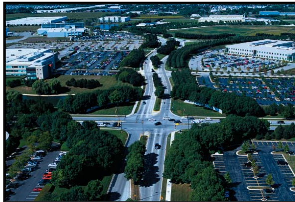
OPPORTUNITY 1 Green Gateway: possible to use on intersection of Hwy 21