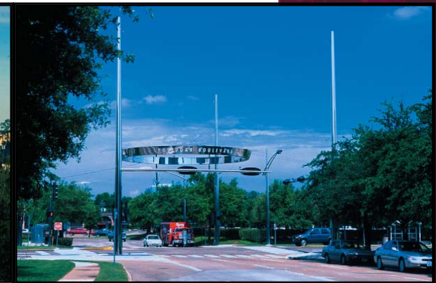
OPPORTUNITY 3 Combine with road signs to create gateway