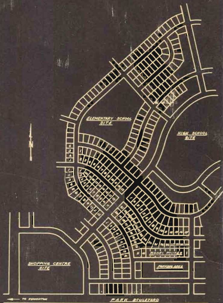
Plot Plan of Sherwood Park . . . first subdivision development of Campbelltown.

Sherwood Park offers an entirely new way of living . . . all the charm and serenity of the country only a few minutes drive on paved highways to Edmonton's metropolitan area. The beauty of this planned community . . . with its shopping centres, schools, parks, playgrounds and churches . . . is enhanced by its setting in the quiet countryside.